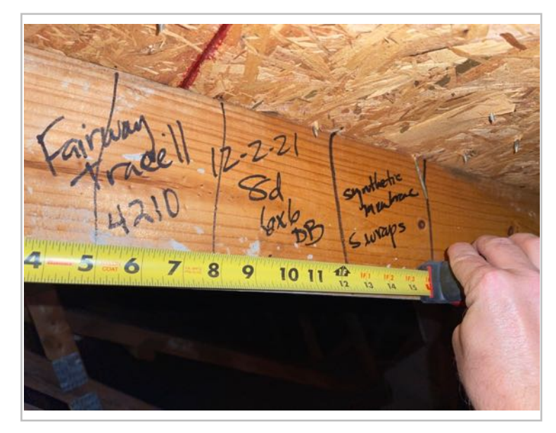
Spacing 8d Nails