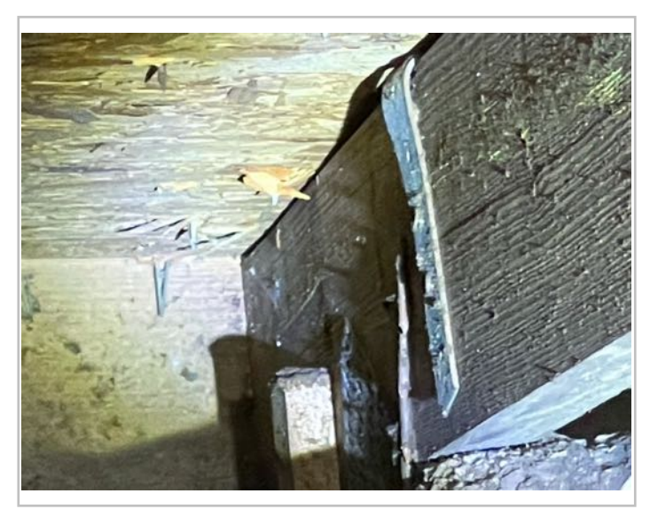
Strap- Opposing Side